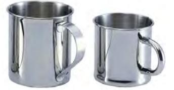
E11 (10 OZ)